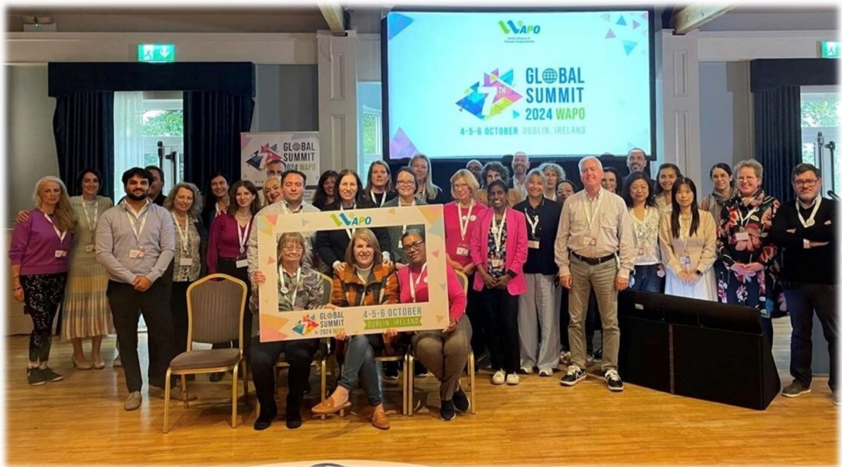
Patient Advocates of Pituitary & Adrenal Patient Organizations, Guest Speakers and Industry Representatives

Industry representative: Thank you so much for the great meeting of last week and for having us to listen and to participate to the event.